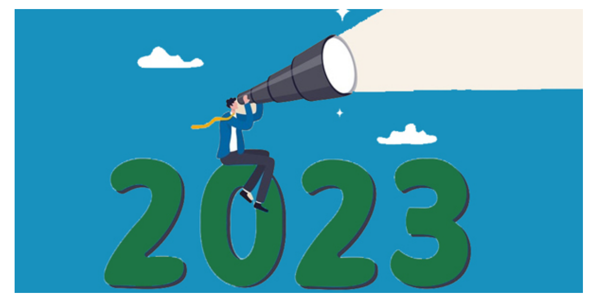
2023 U.S. Economic Outlook and how it will impact credit unions. Read more