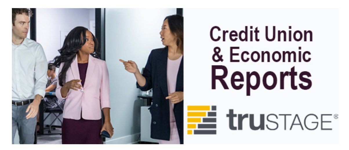
The April 2023 Credit Union Trends Report is now available.