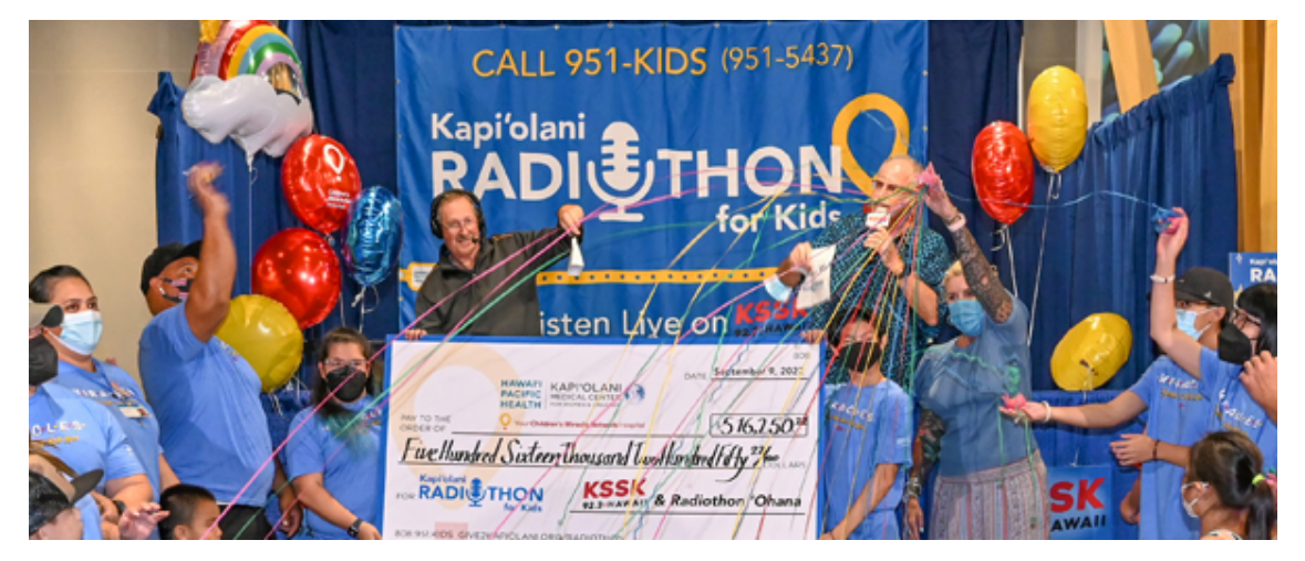
Radiothon is back and looking for CU participation!

The 17th annual Kapiolani Radiothon for Kids is set for Thursday, Sept. 7 and Friday, Sept. 8. Radio stations KSSK FM 92.3/AM 590 and iHeartMedia will be sharing inspiring stories of hope and healing made possible by generous donations to Kapiolani's Children's Miracle Network.