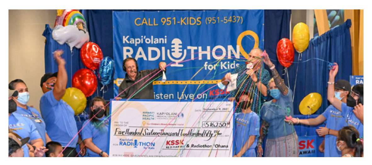
Radiothon is back and looking for CU participation!

The 17th annual Kapiolani Radiothon for Kids is set for Thursday, Sept. 7 and Friday, Sept. 8. Radio stations KSSK FM 92.3/AM 590 and iHeartMedia will be sharing inspiring stories of hope and healing made possible by generous donations to Kapiolani's Children's Miracle Network.