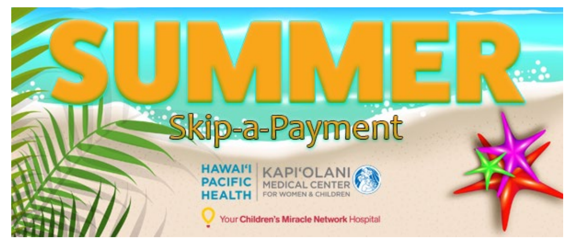
Big Island FCU donates Skip-A-Payment proceeds to Kapiolani Children's Miracle Network!

For many years, Big Island FCU has offered its members Skip-A-Payment promotions during the summer (July or August) and in December. The current skip fee per loan is $30.00.