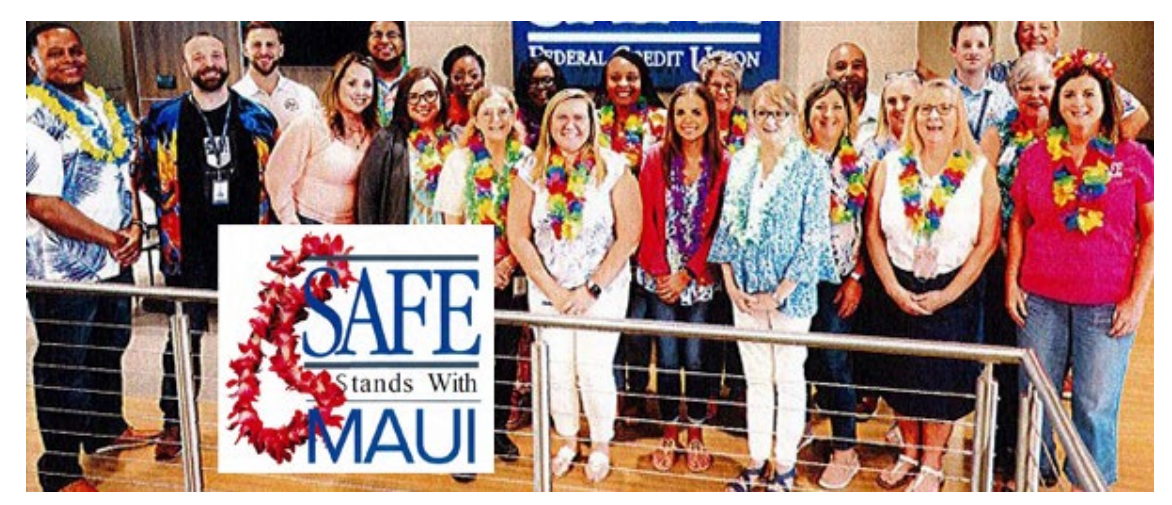
SAFE FCU in Sumter, South Carolina, raises $20,000 for Maui wildfire relief.

Congratulations to the staff and members at Big Island FCU for the generous donation to Hawaii's only pediatric intensive care medical center!