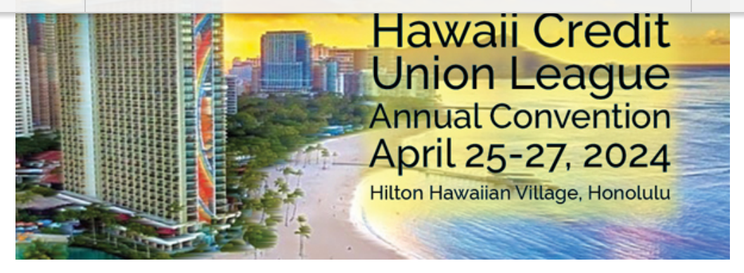
SAVE THE DATE AND JOIN US IN WAIKIKI