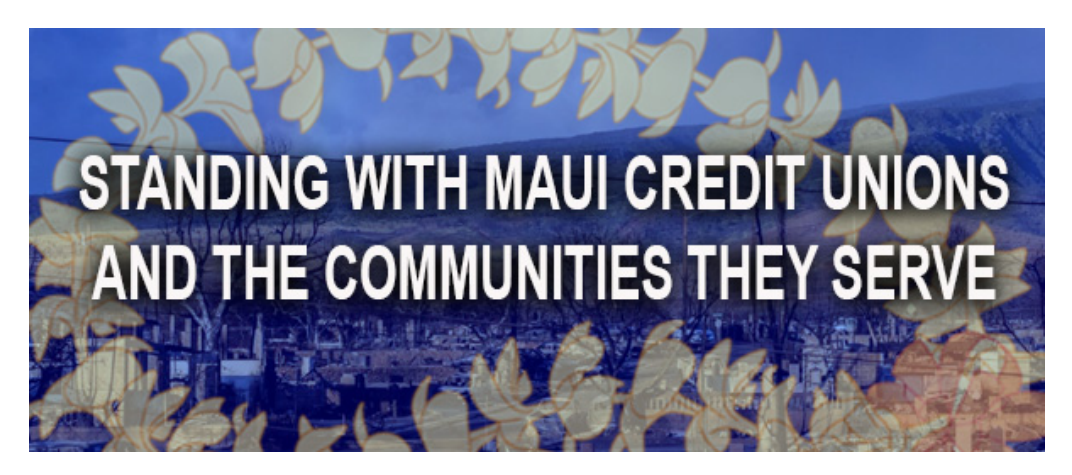
Click here to support Maui wildfire relief