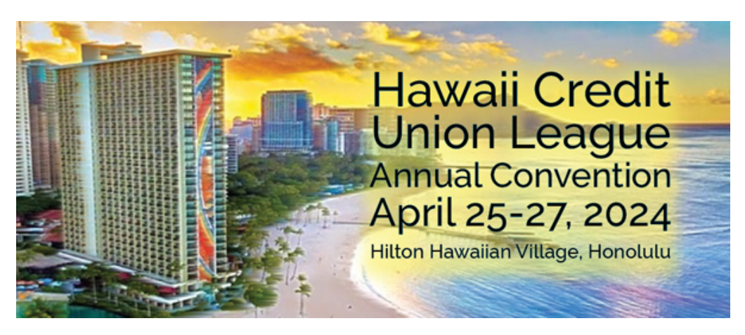
SAVE THE DATE AND JOIN US IN WAIKIKI